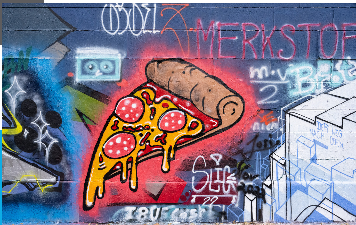
pizza slice by SLICE south of the Rossauer Brücke on the left Donaukanal bank [ 15-11-2022 ]

Friday 25-11-2022 10:00 @ TUWien + Online status quo & road ahead